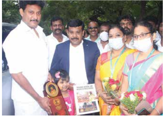
minutes with moral and she was awarded by our Tamilnadu Educational